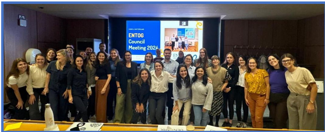
Figure 12 ENTOG Council Meeting 2024

After spending three days visiting these hospitals and exploring their respective cities, all trainees converged in the dynamic city of Zurich. On the 12th of September, our 2nd ENTOG Workshop on Sexual and Reproductive Health was facilitated by Prof. Johannes Bitzer (EBCOG-ESC) and Prof. Gabriele Merki (ESC) , followed by the ENTOG Council meeting (see Figure 12).