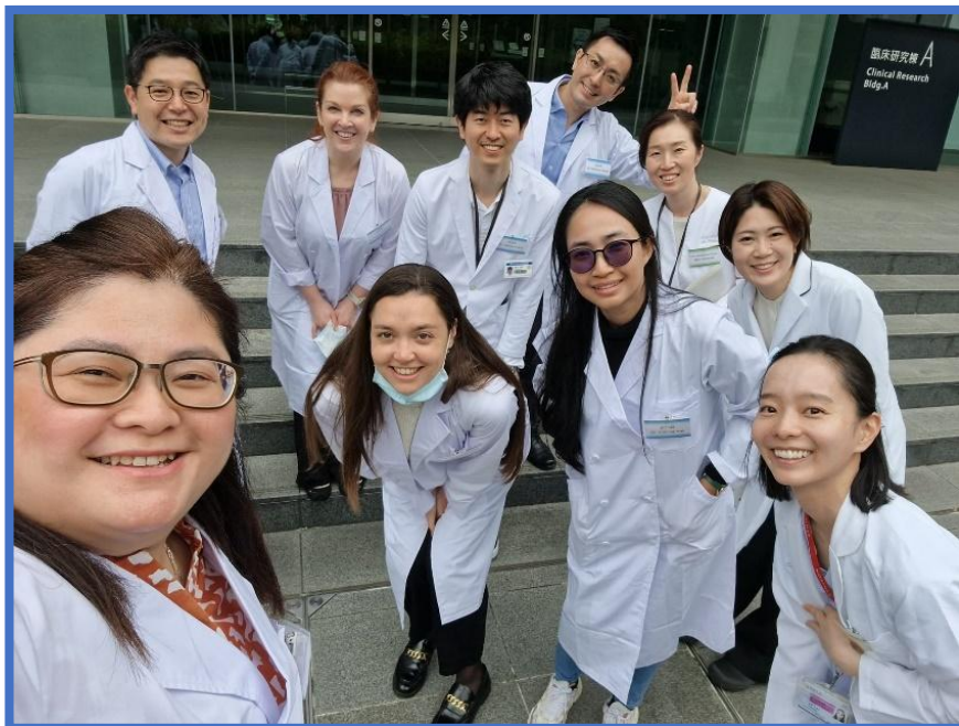
Figure 13 ENTOG trainees travelled to Japan as part of the EBCOG JSOG Exchange programme in April 2024.