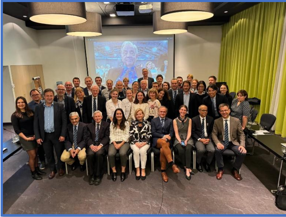
EBCOG Council met in Leuven, Belgium in May and December 2024.