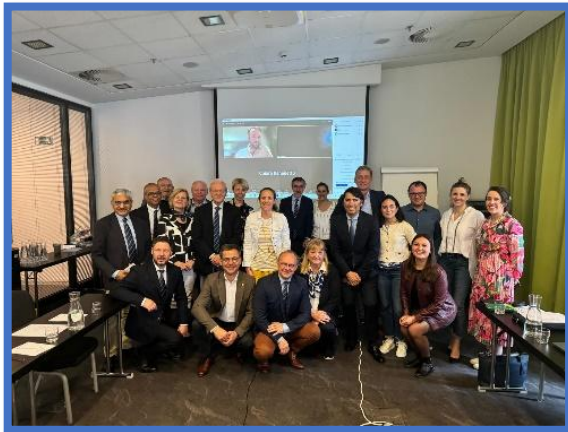
Figure 9 The Congress Committee met in May and December 2024.