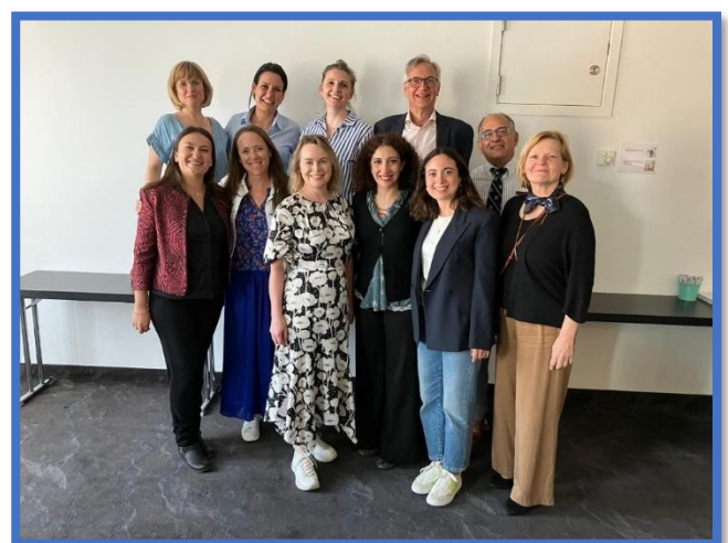
Figure 7 SCTA Committee, May and December 2024