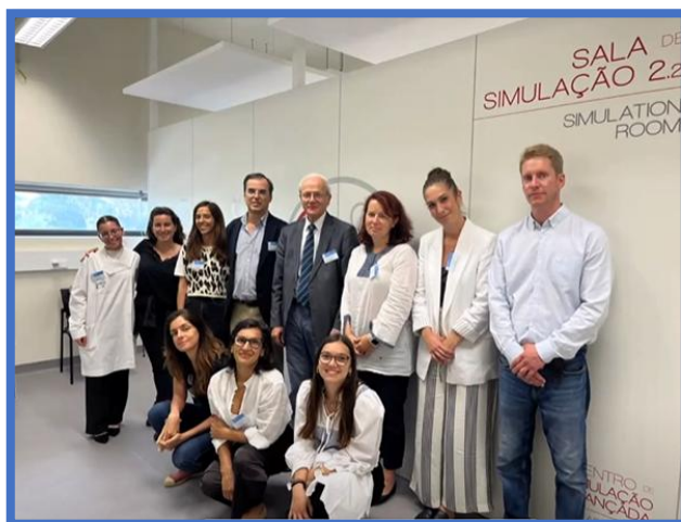
Figure 5 Part 2 OSCE Exam, Lisbon, 29 June 2024