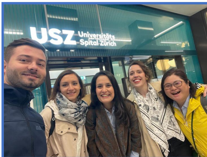
Figure 11 ENTOG Executive Committee 2024-2025