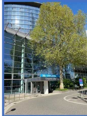
Figure 8 The Officers and ENTOG President made a site visit to Frankfurt in April 2024