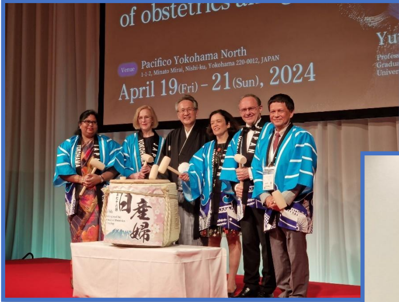
EBCOG Officers attended the Japanese Congress in April 2024 as part of the EBCOG JSOG Exchange Programme.