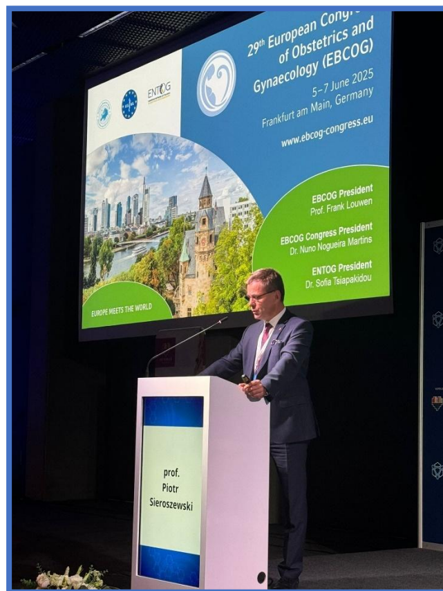
Figure 4 Prof Sieroszewski promoting the EBCOG 2025 Congress

President of the Polish Society of Gynecologists and Obstetricians