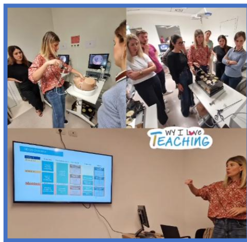
Figure 6 GESEA4EU Basic Training September 2024

In 2024 a GESEA beginners' course was held from Sep 23-24 th and hosted 10 ENTORG trainees. SCTA is grateful to EBCOG for the support towards travel and accommodation for our trainees to attend this course.