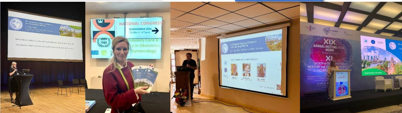
Figure 10 Many Council members have helped to promote the congress.