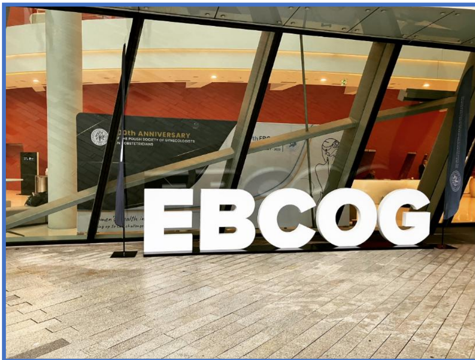
Figure 1 EBCOG Congress May 2023

Consultant Gynaecologist and Associate Professor (Hon) Norfolk and Norwich University Hospital NHS Trust UK