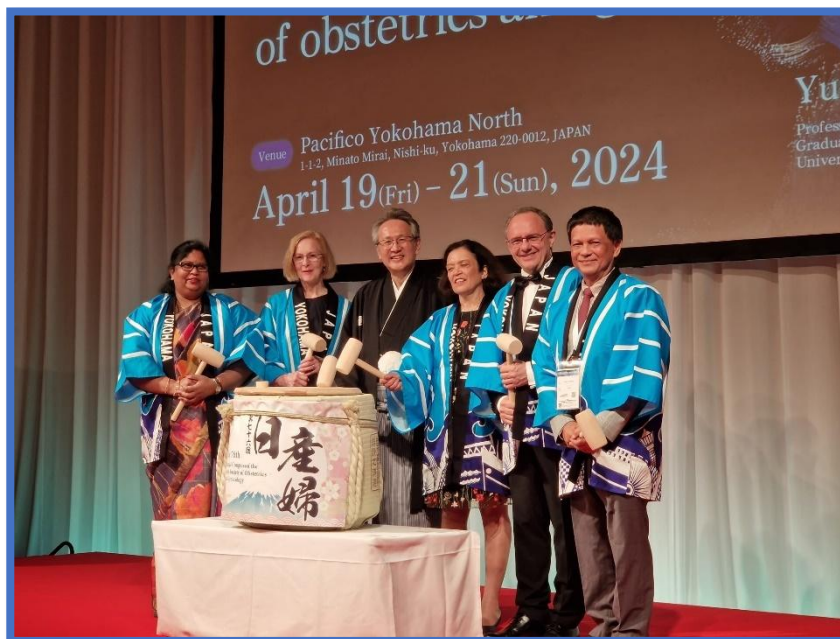
Figure 2: Professor Louwen attending the Annual Congress of the Japan Society of Obstetrics and Gynaecology (JSOG) in April 2024 as part of the exchange programme with JSOG

FRCOG (ad eundem), FAGOS, FICOG, FMOGS, AOGUkraine (hon), IsraelISOG (hon)